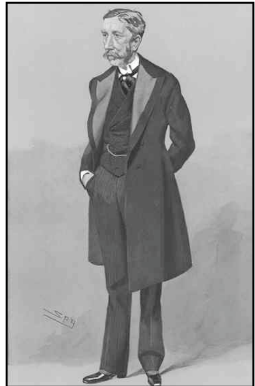
VANITY FAIR , London, c 1907.