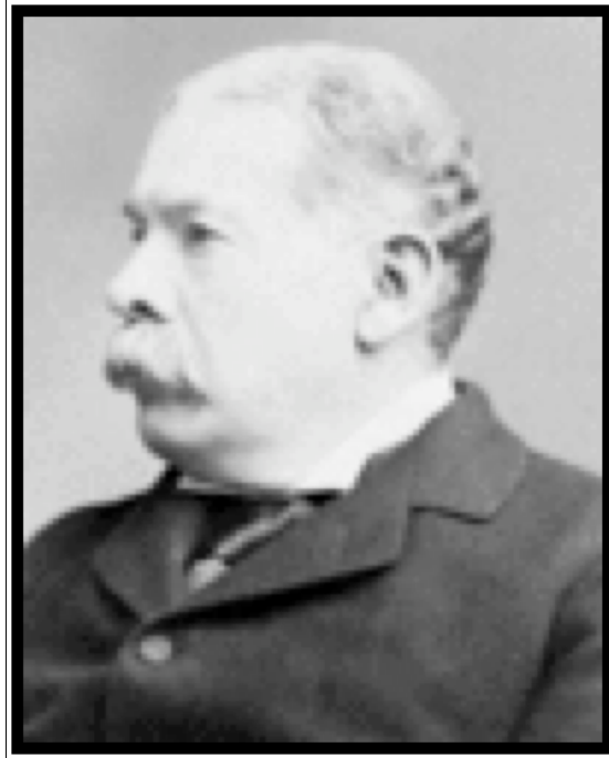
Richard Olney, US Secretary of State

SIR: I have the honor to inform you that riots occurred during the last days of May and early in June in Szechuan at the following places: Chengtu (the capital), Kuan Hsien, Hsin-tu Hsien, Kiang Chou, Kiating, Ya Chou, Mei Chou, Sui Fu, Lu Chou, Pao-ning, P'eng shan, and Hsin-king. 13