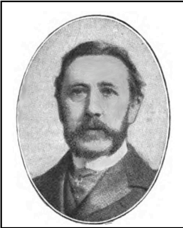
The American monthly review of reviews, Volume 18 1898