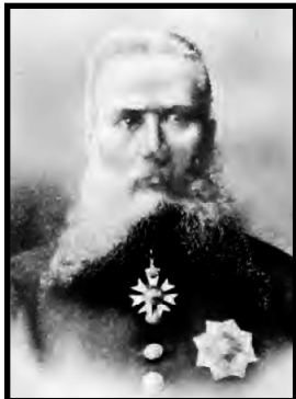
Sir Halliday Macartney

Europeans are, or can be, safe in China outside the limits of the treaty ports. The acceptance of this assertion as a fact would simplify the dealings of the Chinese with foreigners, and would render it unnecessary to institute any inquiry into such crimes as that perpetrated at Ku-cheng. 22