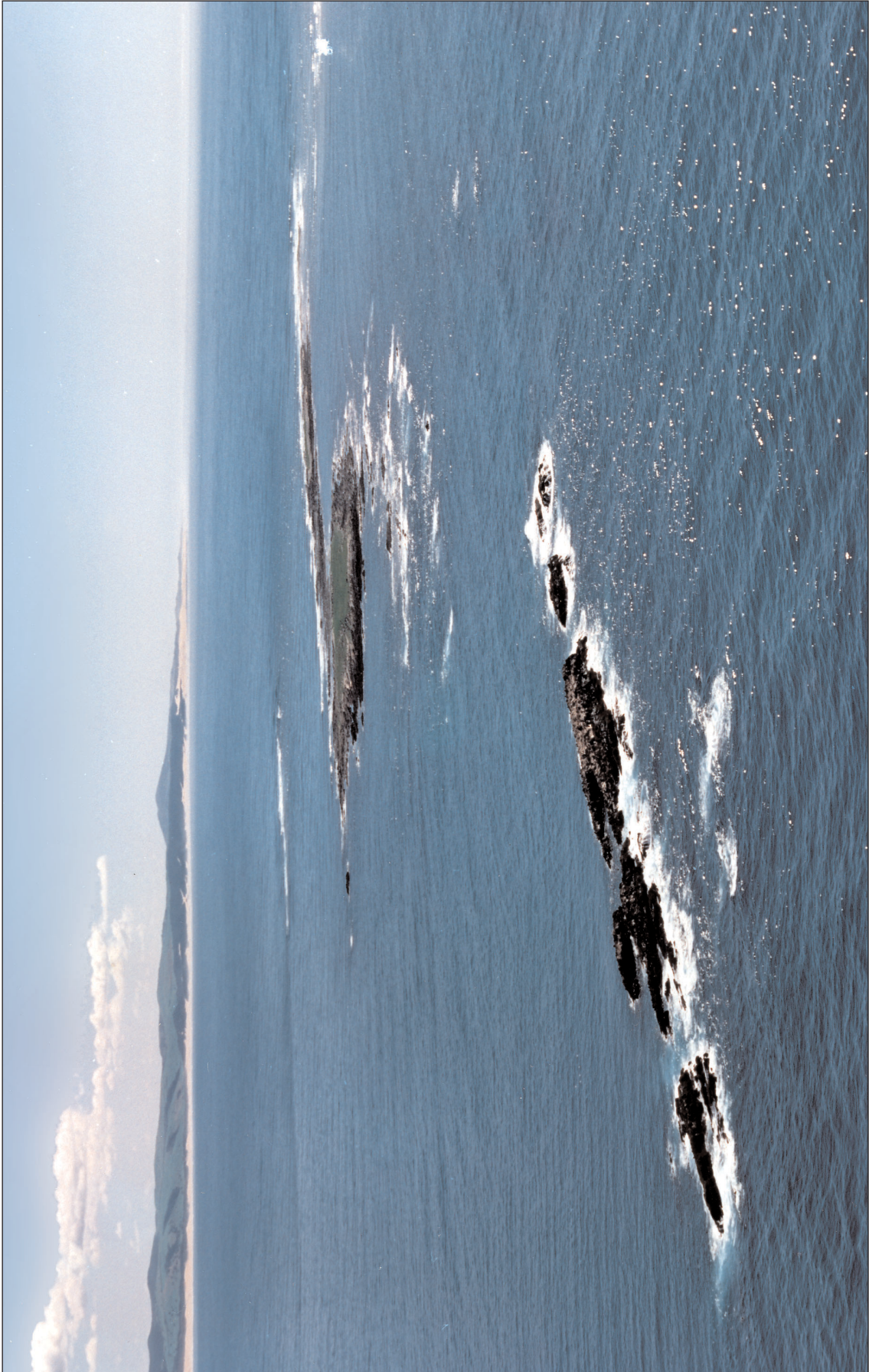
Plate 6 Black Rocks, Algoa Bay (South Africa)