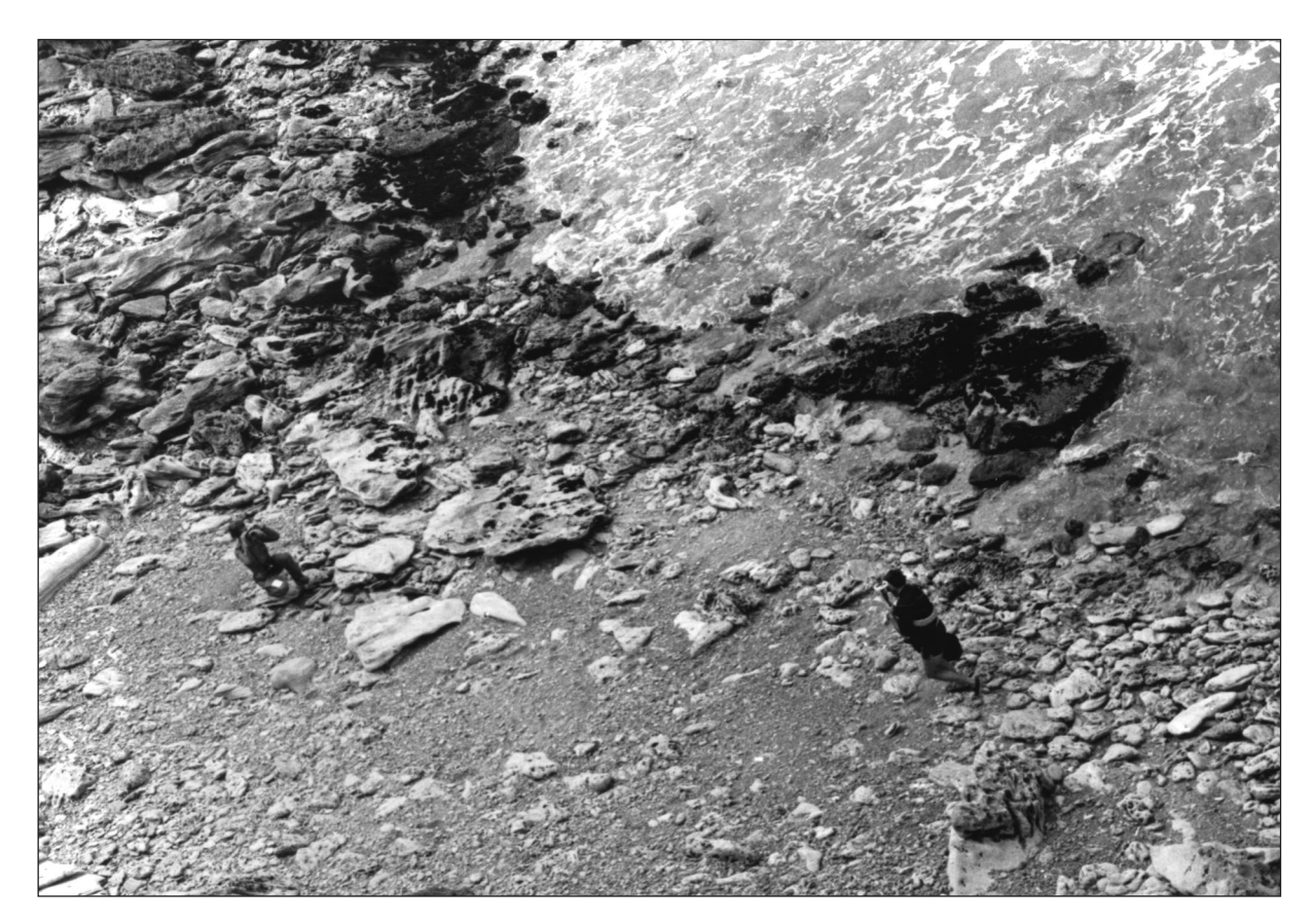
Fig. 10(b).8 Crewman on the ground still attached to hoist cable.