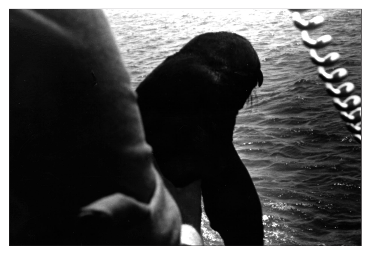
Fig. 10(b).4 Seal pup held over the water prior to release at Black Rocks.