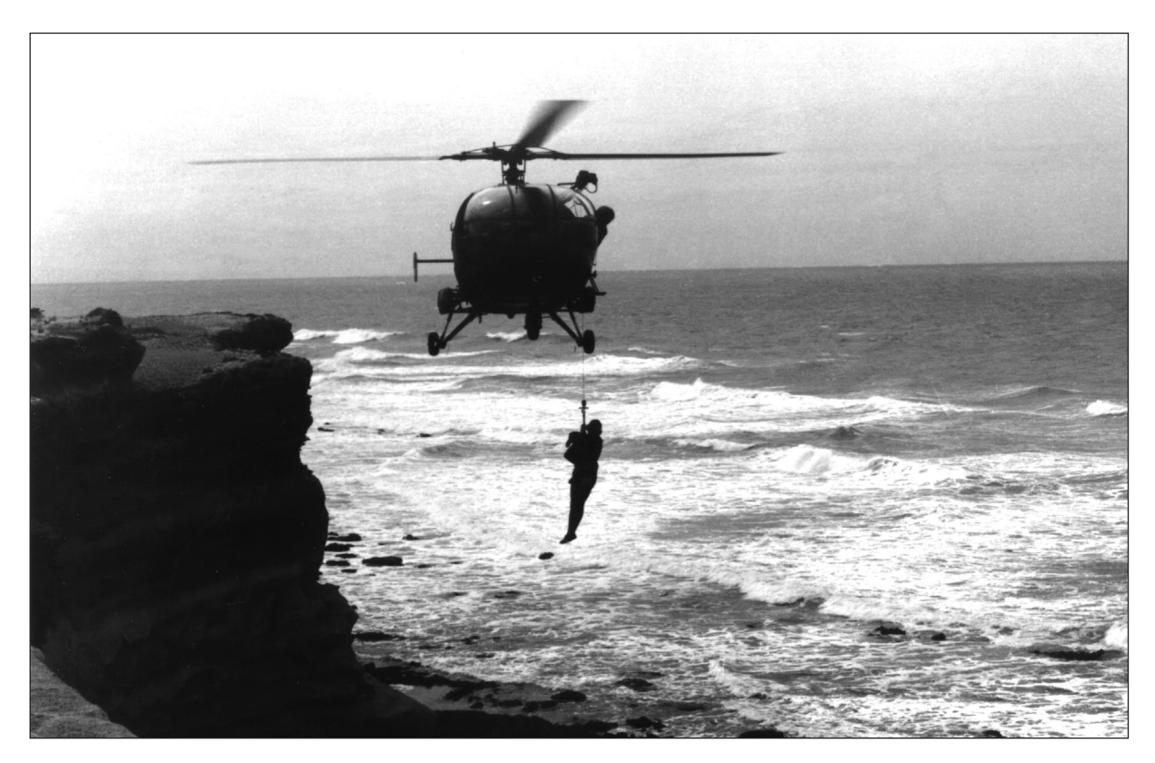
Fig. 10(b).11 Winch hoist up: crewman and pup winched to safety.