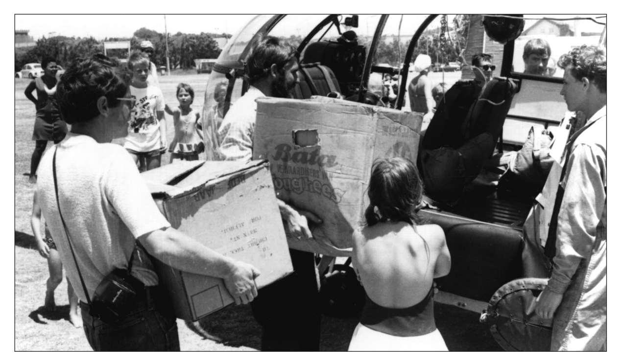
Fig. 10(b).14 Seal pups placed in Alouette III to be airlifted to Black Rocks.

Date: December 14, 1976. Subject: Thirteen pups which had been rehabilitated at the Port Elizabeth Oceanarium were taken to the beach front (Humewood) to be airlifted to Black Rocks. All pups were tagged in the left flipper prior to release.