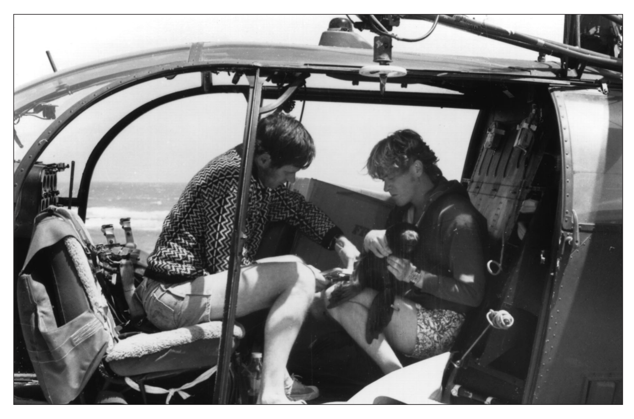
Fig. 10(b).13 Twenty one seal pups were double tagged before being released at Black Rocks.