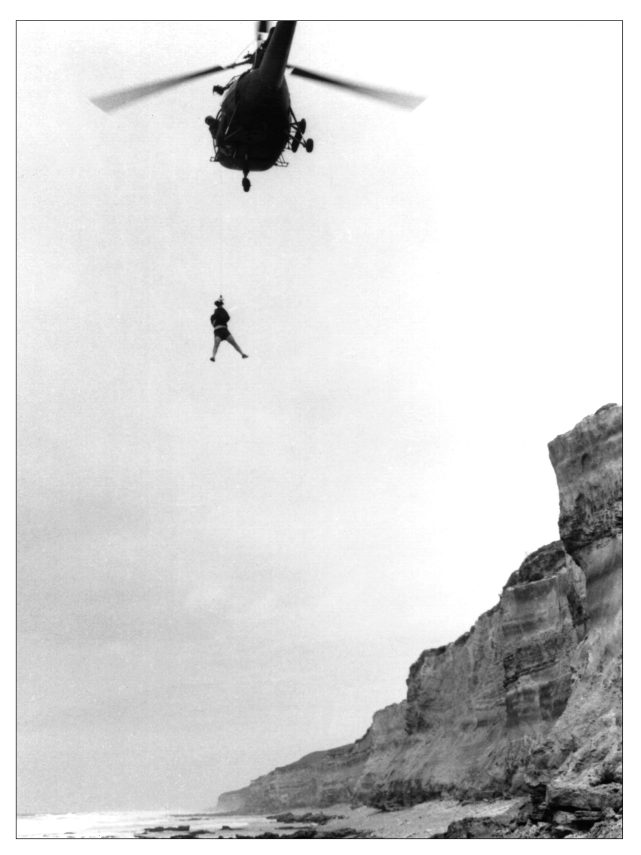
Fig. 10(b).7 Winch hoist down: crewman lowered from helicopter (Alouette III) at Woody Cape. The terrain in this area is inaccessible by four wheel drive.