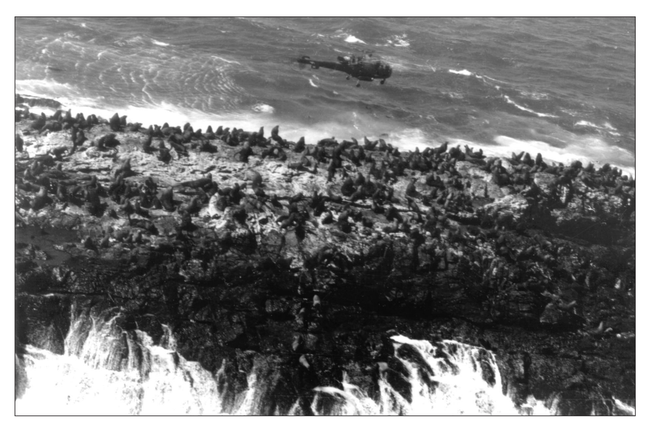
Fig. 10(b).15 Pups gently dropped from the hovering helicopter about 20 m from Black Rocks.