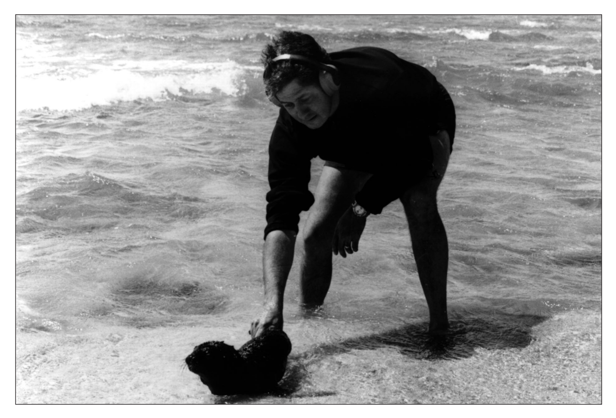
Fig. 10(b).9 Seal pup retrieved by crewman.

Fig. 10(b).8 Crewman on the ground still attached to hoist cable.