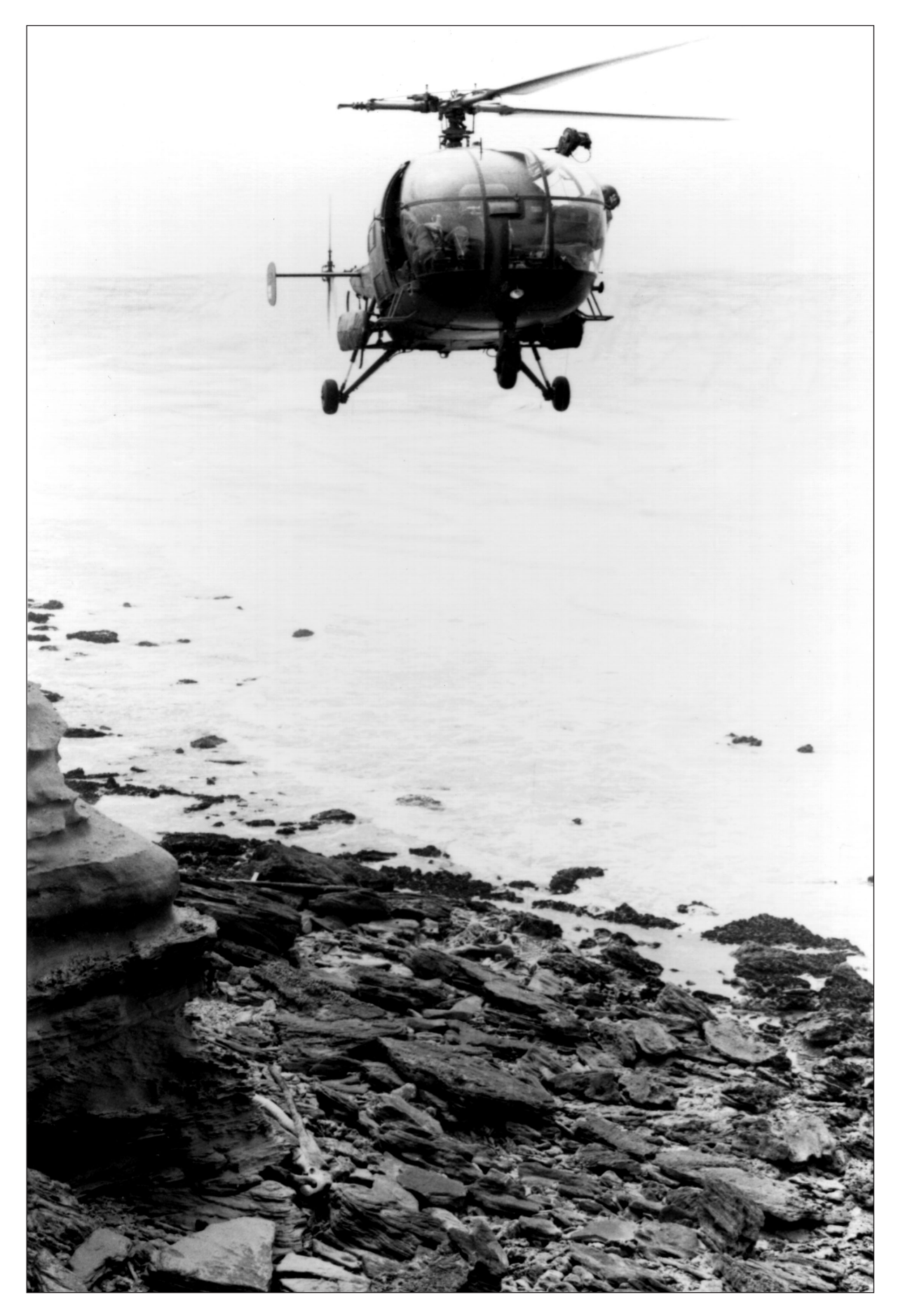
Fig. 10(b).10 Helicopter hovers while waiting for crewman to return with stranded seal pup.