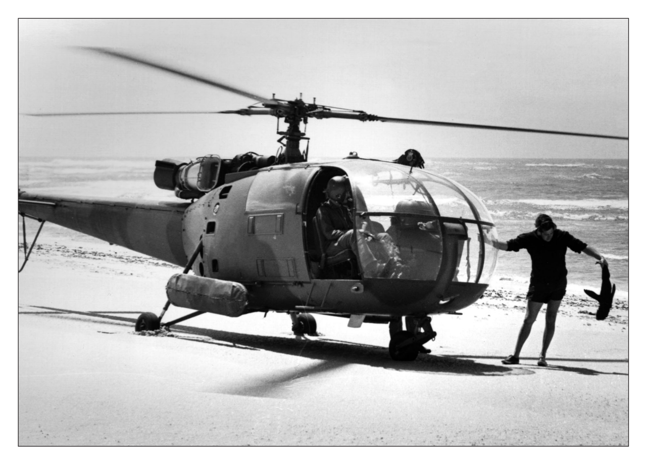
Fig. 10(b).12 Helicopter puts down on sandy beach to retrieve stranded seal pup.