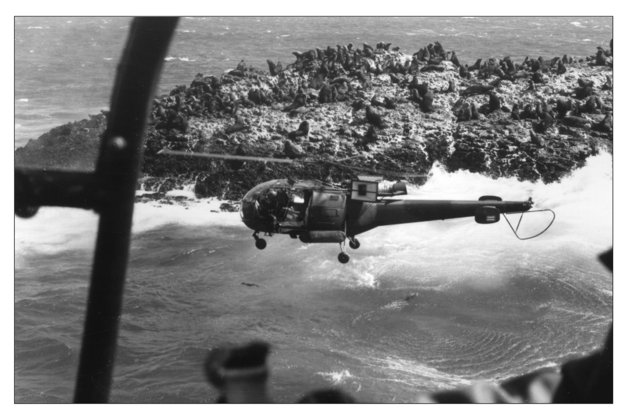
Fig. 10(b).6 Pups gently dropped from the hovering helicopter about 20 m from Black Rocks. Numerous seals remain on the rocks indicating minimal disturbance from the helicopters.