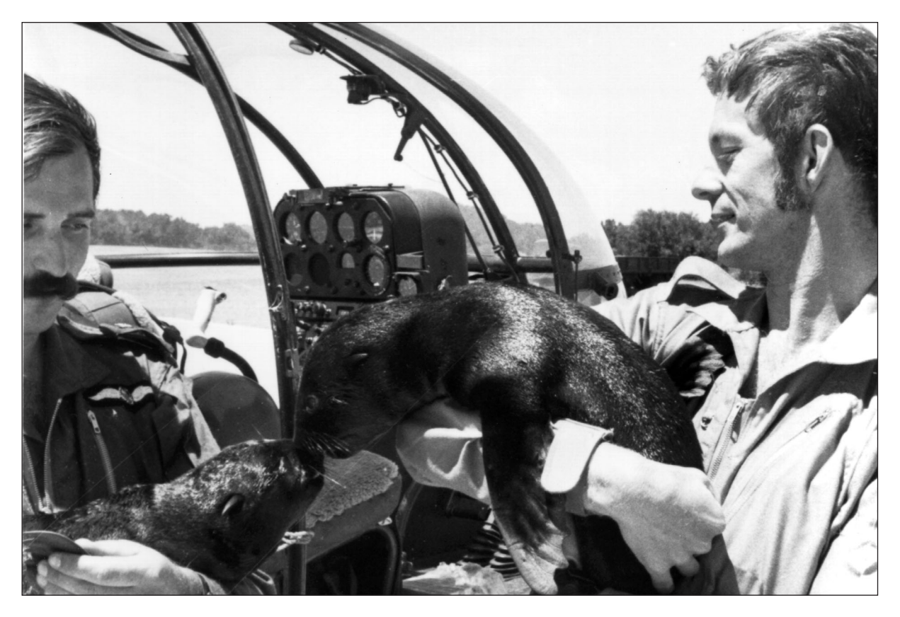
Fig. 10(b).3 Seal pups relax before being placed into the helicopter.

Fig. 10(b).2 SAAF flight crew prepare to airlift seal pups from the Port Elizabeth Airforce Station. The crew had built boxes to secure the seal pups which they placed in the back the helicopter (Alouette III).