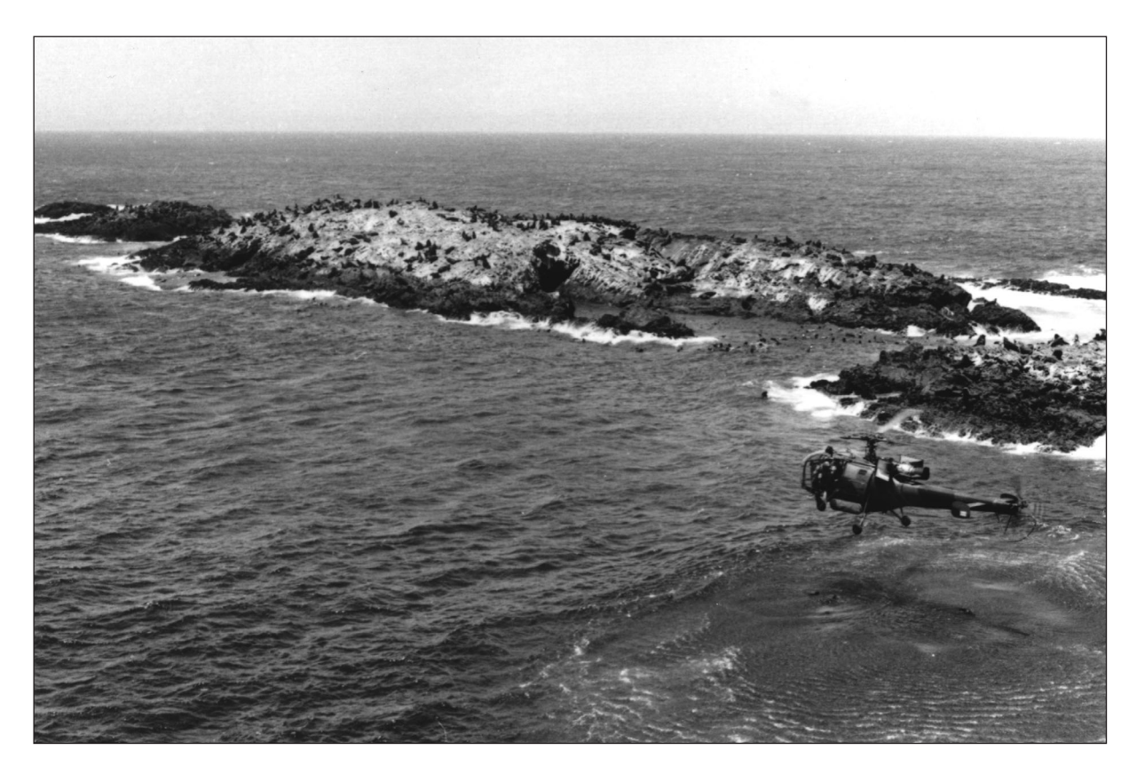
Fig. 10(b).5 Pups gently dropped from the hovering helicopter about 20 m from Black Rocks.