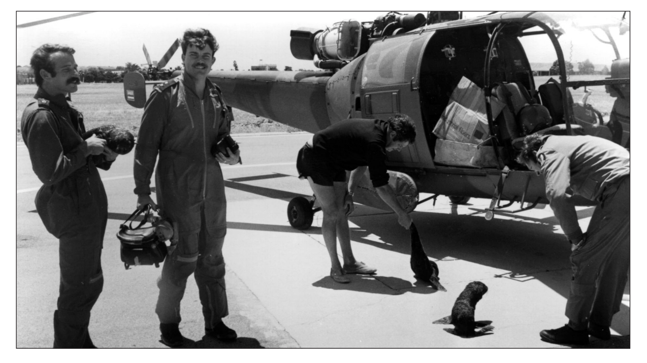
Fig. 10(b).2 SAAF flight crew prepare to airlift seal pups from the Port Elizabeth Airforce Station. The crew had built boxes to secure the seal pups which they placed in the back the helicopter (Alouette III).

Date : Wednesday, December 8, 1976. Subject : Six stranded seal pups that had been rehabilitated at Port Elizabeth Oceanarium, were taken to the Port Elizabeth Airforce Station and then airlifted to Black Rocks.