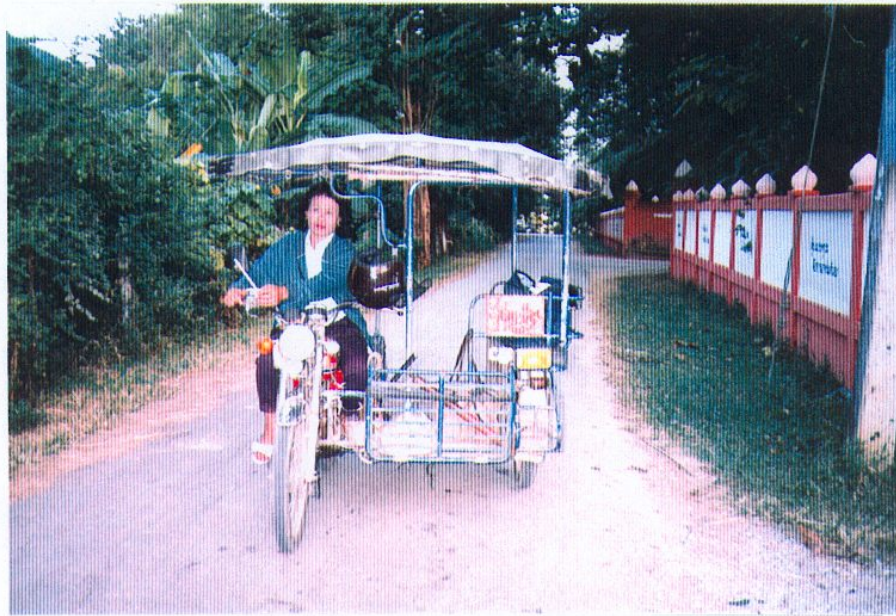
Plate 17 A female villager driving a motor-cycle taxi to earn additional income to support her family.