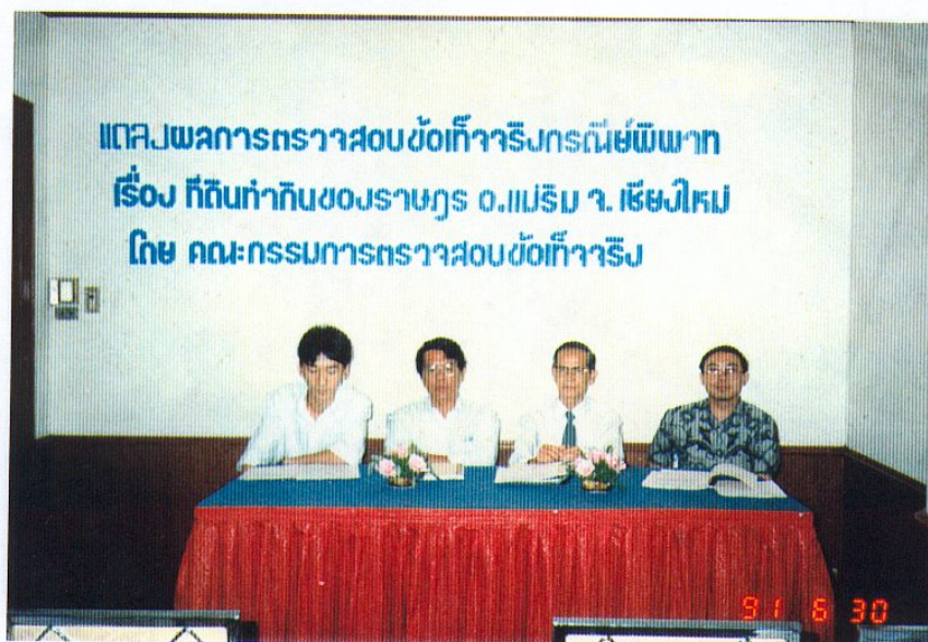
Plate 26 Through NGO networks, villagers receive the support of lawyers, intellectuals and university students from middle class backgrounds who undertake fact finding and report to the media