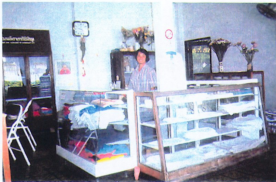
Plate 20 Handicraft products being sold in the compound of Wat Pa Temple, Mae Rim.