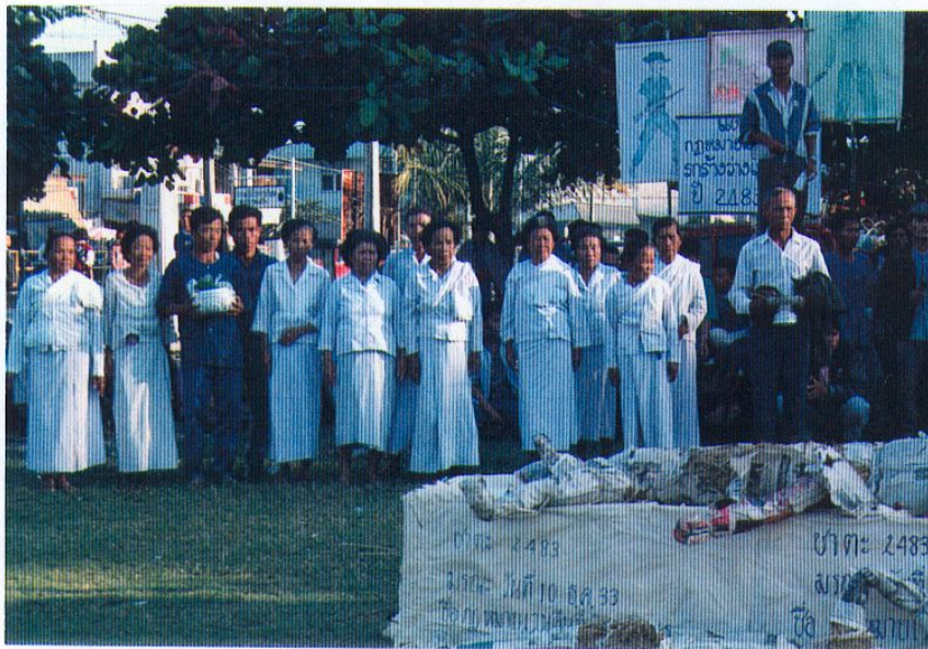
Plate 25 Female elders dressed in white go to negotiate with the military to save the village land. Their presence and attire demonstrate the intention to seek peaceful negotiations.