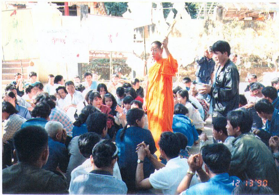
Plate 21 Villagers and NGO workers receiving sacred water ( nam mon ) from the abbot of the village temple before going to protest against the military land take over.