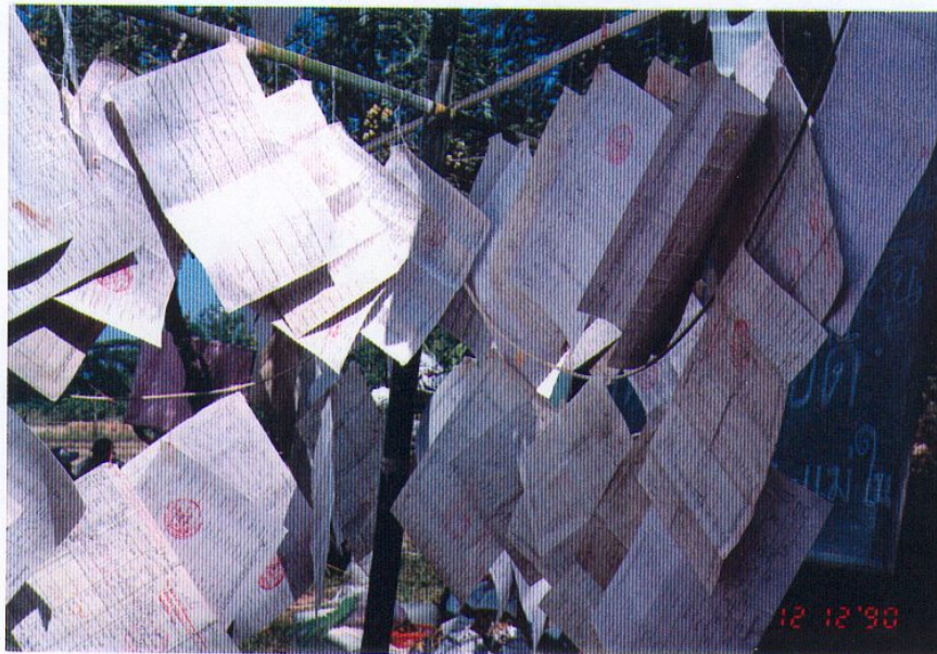
Plate 24 Household registration documents were also carried to the District Office as a form of protest against inadequate state assistance for the welfare of the village