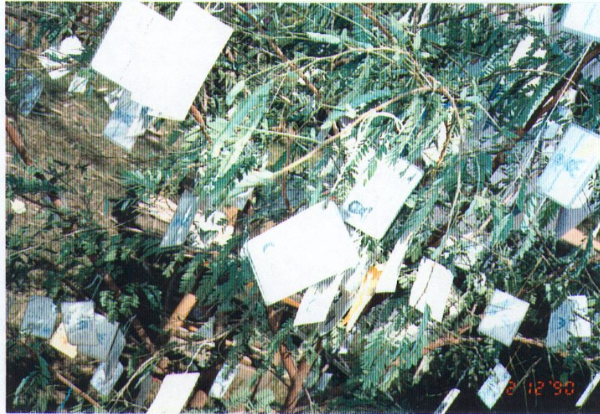
Plate 23 ID cards hung on a branch of a tree (as is done in the Tho:d pha pa ceremony) and carried to the District Office as a form of protest against inadequate state assistance for the welfare of the village.