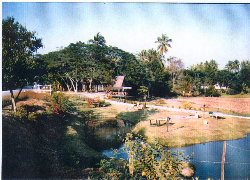
Plate 18 Some villager work at a tourist resort near Village 3 for extra family income.