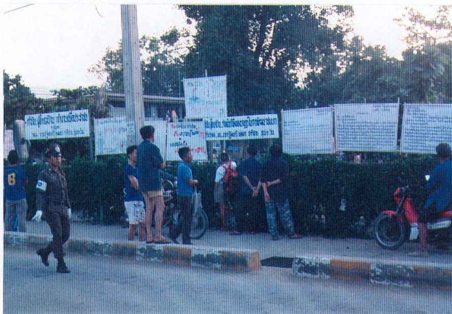
Plate 22 Posters explaining the cause of the land dispute to the public.