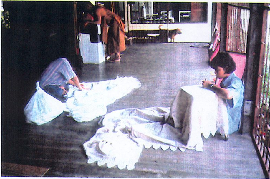
Plate 19 FEDRA's handicraft project to help villagers earn additional family income.